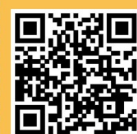
International Student Center 留学生教育管理中心