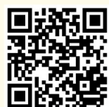
英文授课硕博项目